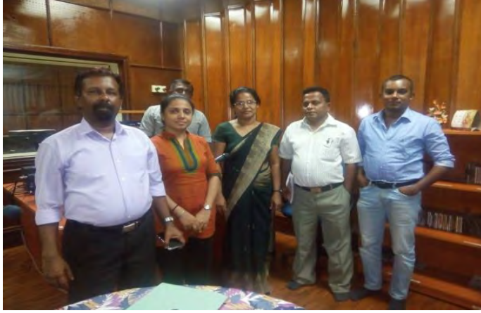
Participating in the 'Sankathana' Programme of 'Krushi FM'